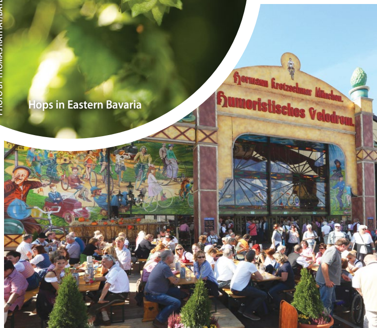
Oktoberfest in Munich, Germany