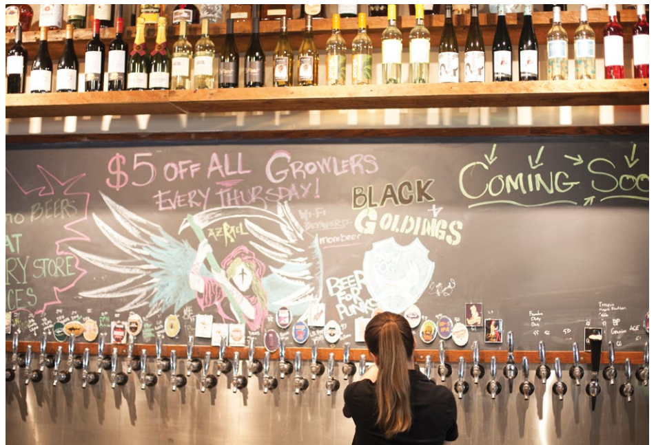
Capital Ale House, Richmond, Virginia

Richmond Brewery Tours has several local partners and participating breweries. Among them is Hardywood Park Craft Brewery, which helped establish Richmond as a craft-beer destination, having earned international acclaim at multiple beer competitions, most recently taking home the bronze medal for Wood and Barrel Aged Strong Stout at the 2016 World Beer Cup.